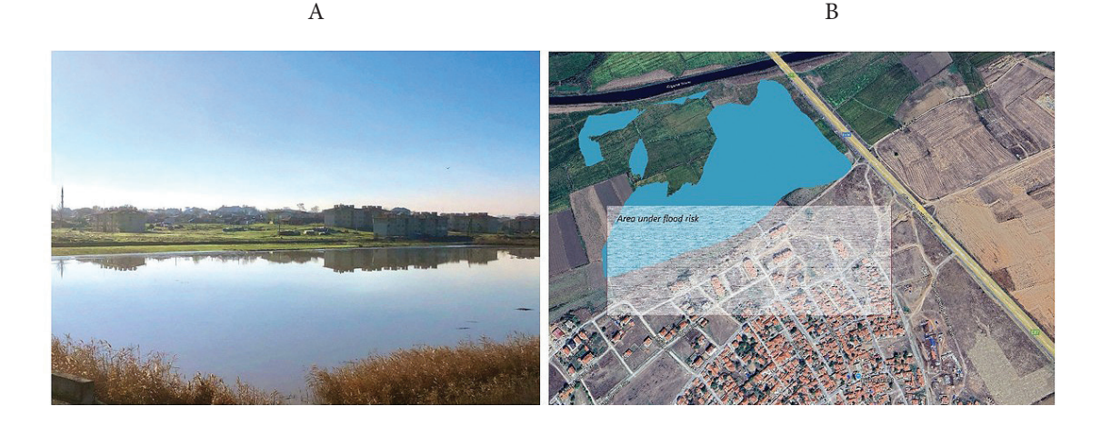
Figure 2a. Flood water advancing towards a Romani neighbourhood by Sergen Gül, 18 December 2023. Figure 2b. The Ergene River and the Romani neighbourhood of Aşçıoğlu. Source: Google Earth Pro.

According to interviewee C – together with the statement of interviewee A, a third-generation Romani-Muslim migrant – Roma in the Ergene Basin are marginalised by class and ethnicity. Socio-economic inequalities and power imbalances in the Ergene Basin, deepened by laws and institutional racism, have resulted in spatial stigmatisation and environmental injustice. Drawing on interviewee C's insight, it can be concluded that as a result of environmental degradation in the river, pollution is concentrated in Romani neighbourhoods and not everyone is affected in the same way. As a result, the environmental risk and degradation tip toward Roma while sparing gaco (non-Roma).