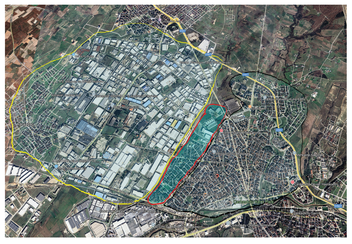
Figure 3. The yellow polygon outlines the industrial zone, the black polygon denotes the Fevzi Paşa neighborhood, and the red polygon highlights the area predominantly inhabited by the Romani community.

According to him, the supervisory mechanisms related to air pollution try to stigmatise the complainant by asking for personal information rather than considering the individual's complaint. He then emphasised that the factories that cause air pollution in Çerkezköy are inadequately supervised: "There is no control, they turn the filters on during the day and off at night, they don't care about the environment. I live in the Fevzi Paşa neighbourhood, we cannot open the window at night. When we do, the air smells like plastic. When we wash the laundry, even the tops get wet and dusty from the chemicals. The factories in the Fevzi Paşa neighbourhood are very close to each other. For example, if our house is here, the factories start 100 meters later." Based on interviewee's statements, it can be concluded that the state uses the tactic of a lack of supervision to control environmental pollution in Çerkezköy.